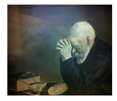
Encourage Each other and build each other up. 1 Thessalonians 5:11

To disciple others in Christ by sharing the gospel Through our words and actions, To nurture existing Christians into a mature faith by worship, fellowship and Christian education, To prayerfully serve God by worshiping Him Through Jesus Christ By the power of the Holy Spirit, And to serve our neighbors as Jesus taught us.